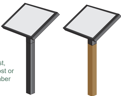
45 Degree Aluminum Post, your Wood Post or Recycled Lumber Post