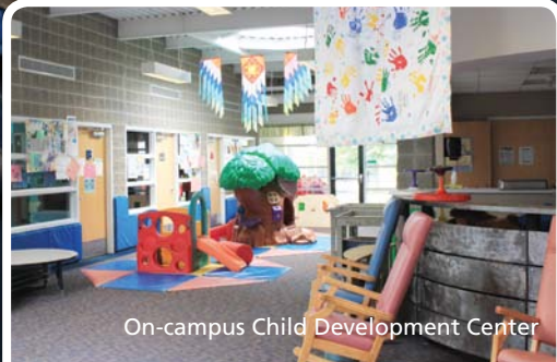
On-campus Child Development Center