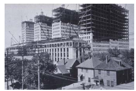
General Motors Building/LTU