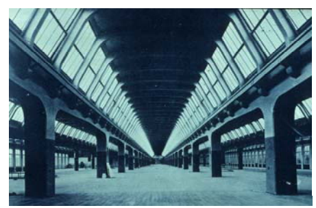
Ford Engineering Lab, Dearborn/LTU