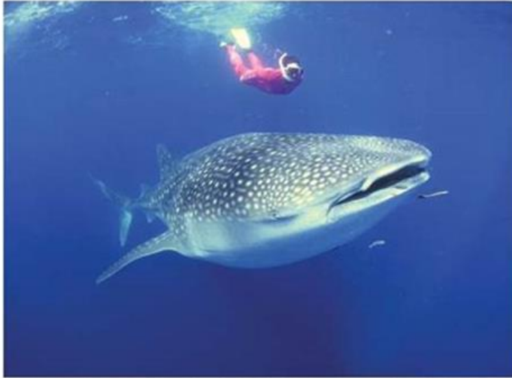
A diver swims with a whale shark , the largest of all living fish. The whale shark is harmless to humans.

The whale shark is the largest fish in the world. It is an endangered species , which means that it is in danger of disappearing forever. The scientific name of the whale shark is Rhincodon typus .