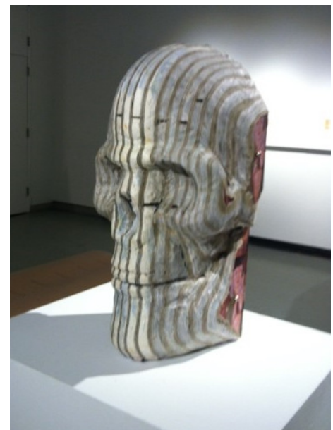
Long-Bin Chen, Skull , 2011, Art Catalogs

314 South Park Street - Kalamazoo, MI 49007 (269) 349-7775 www.kiarts.org